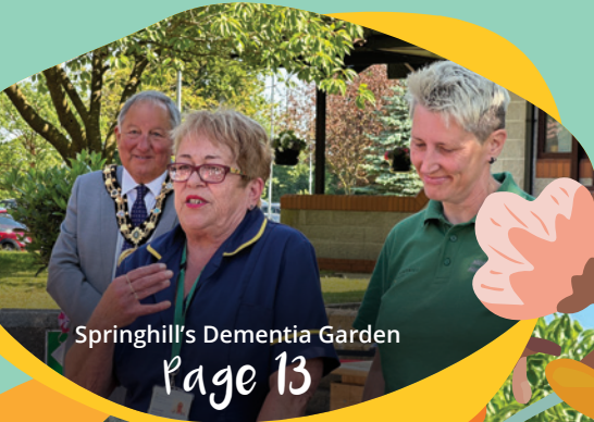
Springhill's Dementia Garden Page 13